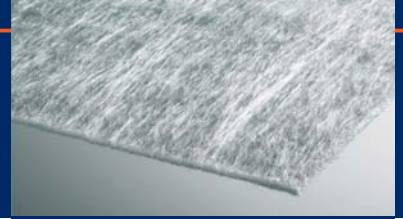
TenCate Polyfelt TS

TenCate Polyfelt TS geotextiles are mechanically bonded continuous filament nonwovens made from 100% UV stabilized polypropylene. They have been used for decades as separation and filtration elements in a large number of civil engineering applications.